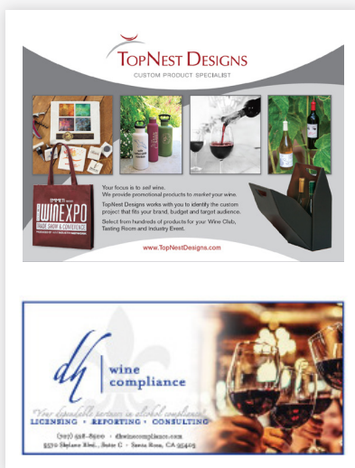
Horizontal 1/3 Page 7.5" x 3.22"