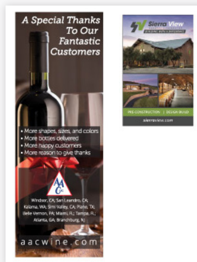
Vertical 1/2 Page 3.625" x 10"