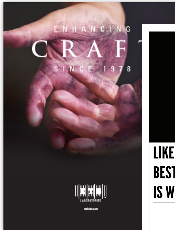
Back Cover, Inside Covers & Full Pages w/ Bleed 8.75" x 11.25" Trim size: 8.5" x 11" Live Area: 8" x 10.5"