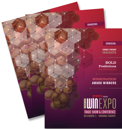
2019 Program Guide